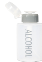
Bottles & Dispensers

Find our full line of products at dukal.com